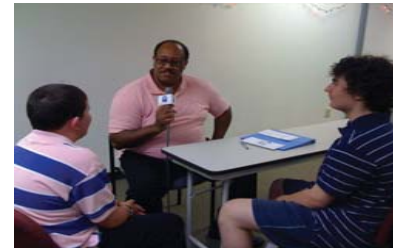
Both winners who came to the reading were interviewed live on Brandywine Radio!

Would the sight of black lungs on the side of a pack of cigarettes keep you from smoking? Students from Delaware County schools were asked to participate in a World No Tobacco Day Essay Contest with "Tobacco Health Warnings" as the topic. The subject reinforced the need to step up graphic warnings on tobacco packages to discourage consumers from using any form of tobacco products. The essayists took the opportunity to make a stand against the dangers of tobacco use.