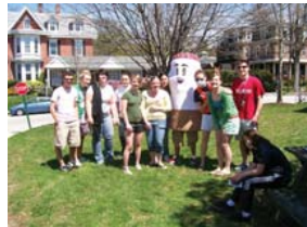
Many local youth volunteered their time to help with the Media cleanup event!

On April 22, 2009, more than twenty five high school students donated their time and their hands in a special cleanup effort on the streets of Media, PA. The students worked for an hour collecting discarded cigarette butts along length of State Street, as well as the neighborhood around Barrall Park.