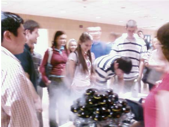
Students from Ridley High School check out the Ashtrays to Art project.

As part of a national campaign to encourage people to quit smoking for one day, the Delaware County Tobacco-Free Coalition sponsored educational tables at the Media Government Center and the Granite Run Mall for the Great American Smoke Out (GASO) on Thursday, November 20, 2008.